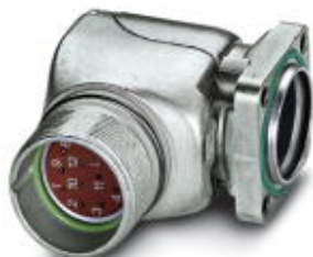
Device connector, front mounting, angled rotatable, Screw locking, M23, number of positions: 12, type of contact: Pin, Crimp connection, Axial O-ring, 4x Ø 3.2, shielded: yes, flange dimensions: 28 mm x 28 mm

Please be informed that the data shown in this PDF Document is generated from our Online Catalog. Please find the complete data in the user's documentation. Our General Terms of Use for Downloads are valid ( http://phoenixcontact.com/download )