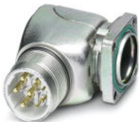
Device connector, front mounting

Please be informed that the data shown in this PDF Document is generated from our Online Catalog. Please find the complete data in the user's documentation. Our General Terms of Use for Downloads are valid ( http://phoenixcontact.com/download )