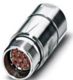
Coupler connector, straight, Screw locking, M23, number of positions: 12, type of contact: Pin, Crimp connection, shielded: yes, cable diameter range: 6 mm ... 10 mm

Please be informed that the data shown in this PDF Document is generated from our Online Catalog. Please find the complete data in the user's documentation. Our General Terms of Use for Downloads are valid ( http://phoenixcontact.com/download )