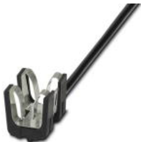
Shield connection clip, length: 100 mm, color: black

Please be informed that the data shown in this PDF Document is generated from our Online Catalog. Please find the complete data in the user's documentation. Our General Terms of Use for Downloads are valid ( http://phoenixcontact.com/download )