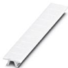
Zack marker strip, 10-section, horizontally labeled with the consecutive numbers: 361 ... 370, white, width: 6 mm

Please be informed that the data shown in this PDF Document is generated from our Online Catalog. Please find the complete data in the user's documentation. Our General Terms of Use for Downloads are valid ( http://phoenixcontact.com/download )