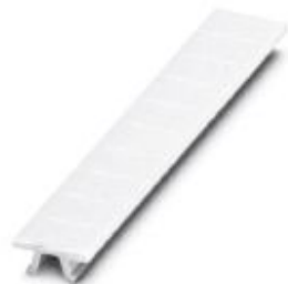
Zack marker strip, 10-section, horizontally labeled with the consecutive numbers: 351 ... 360, white, width: 6 mm

Please be informed that the data shown in this PDF Document is generated from our Online Catalog. Please find the complete data in the user's documentation. Our General Terms of Use for Downloads are valid ( http://phoenixcontact.com/download )