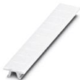
Zack marker strip, 10-section, horizontally labeled with the consecutive numbers: 341 ... 350, white, width: 6 mm

Please be informed that the data shown in this PDF Document is generated from our Online Catalog. Please find the complete data in the user's documentation. Our General Terms of Use for Downloads are valid ( http://phoenixcontact.com/download )