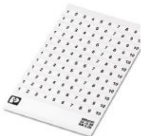
Marker card, self-adhesive, horizontally labeled with the consecutive numbers: 61 ... 70, 10-section marker strips with 12 identical decades, white

Please be informed that the data shown in this PDF Document is generated from our Online Catalog. Please find the complete data in the user's documentation. Our General Terms of Use for Downloads are valid ( http://phoenixcontact.com/download )