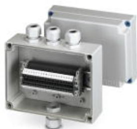
Terminal box, With 20 terminal blocks, 2.5 mm 2 with screw connection technology, material: ABS, gray, 180 mm x 130 mm x 100 mm, type of locking: Screw-on cover

Please be informed that the data shown in this PDF Document is generated from our Online Catalog. Please find the complete data in the user's documentation. Our General Terms of Use for Downloads are valid ( http://phoenixcontact.com/download )