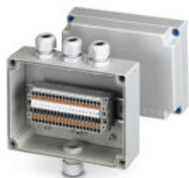
Terminal box, With 20 terminal blocks, 2.5 mm 2 with push-in technology, material: ABS, gray, 180 mm x 130 mm x 100 mm, type of locking: Screw-on cover

Please be informed that the data shown in this PDF Document is generated from our Online Catalog. Please find the complete data in the user's documentation. Our General Terms of Use for Downloads are valid ( http://phoenixcontact.com/download )