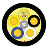
FSHRB12-04S12C 12 fiber Loose Tube with 4x12 AWG