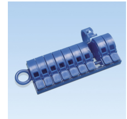
PMO EMPTY DISPENSER