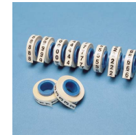
PMO - * - *