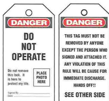
Front PST-3 Back