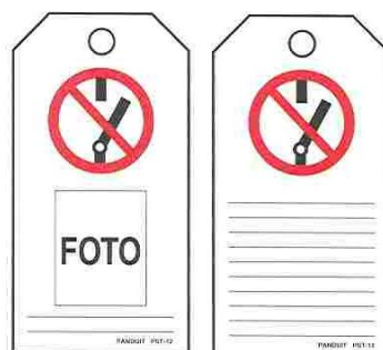
Front PST-12 Back