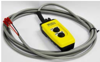
A: Hand Pendant Unit

Dimensions listed are approximate, and for reference only.