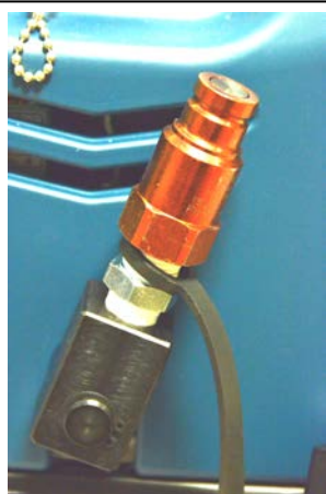
FIG. 2: 5K CONNECTOR