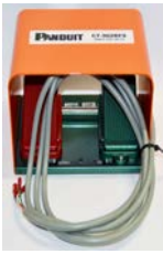
B: Remote Foot Switch (RFS) Unit