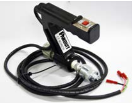
C: Remote Control Handle (RCH)Unit