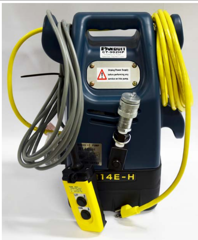
FIG. 1: CT-902HP HYDRAULIC PUMP SHOWN (WITH HAND PENDANT)