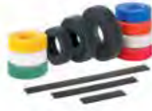
HLS (Strip Ties)