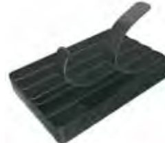
HLB (Stacked Strips)