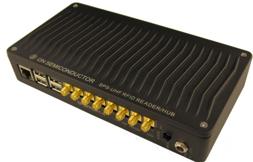
SPS UHF Reader / Hub Server CASE MODGM