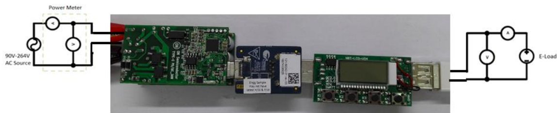
Figure 2: QC Test Setup for 45W PD/QC Demoboard