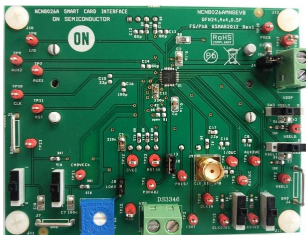
Figure 1. Evaluation Board

This document has to be used with the NCN8026A datasheet. The datasheet contains full technical details regarding the NCN8026A specifications and operation. The board (FR4 material) is implemented in two metal layers. The top and bottom layers have thicknesses of 35 \mu\text{m} . The PCB thickness is 1.6 mm with dimensions of 89 mm by 68 mm (see Figure 1).