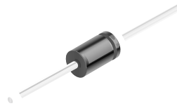
DO-35 Color Band Denotes Cathode