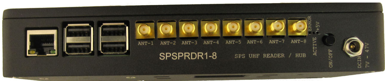
Figure 1. Port Connections

See detailed ordering and shipping information on page 2 of this data sheet.