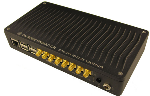
SPS UHF Reader / Hub Server CASE MODGM