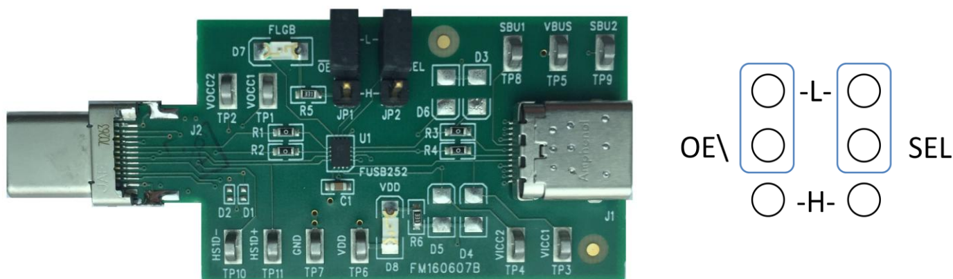
Figure 1 – Board Top View and DP/DM Select Pin Map

After performing OVP testing, the Type-C receptacle can accept a Type-C device such as a memory stick to demonstrate normal USB functionality (with SEL=L).