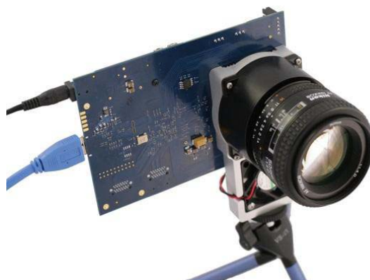
Figure 1. Evaluation Board Picture