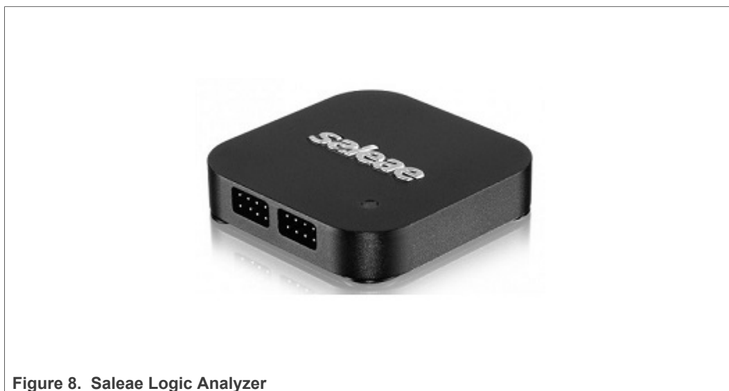
Figure 8. Saleae Logic Analyzer

Saleae provides a software interface with its product to help decode the acquired signals. To learn more, visit the Saleae website .