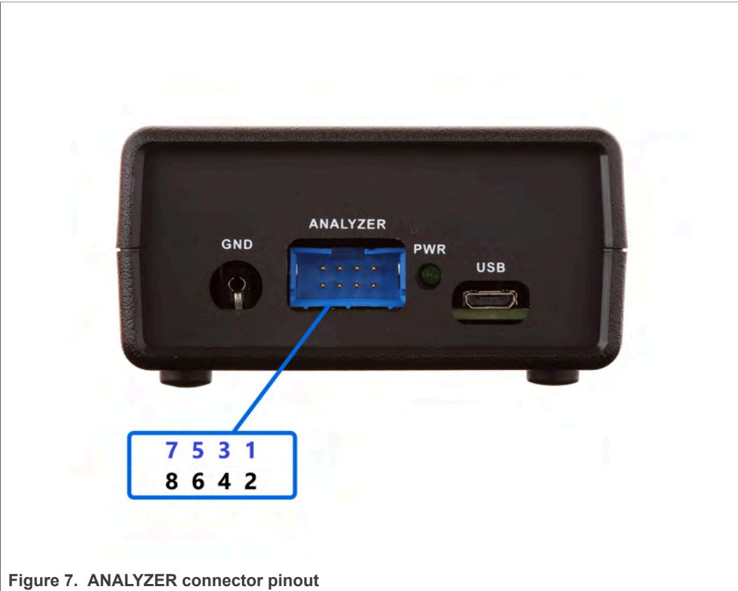
Figure 7. ANALYZER connector pinout

The supplied 8-pin connection cable should be plugged into the ANALYZER connector with the blue wires on top (NXP logo side) and the black wires on the bottom.