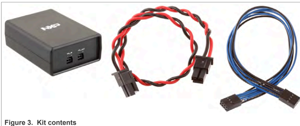
Figure 3. Kit contents