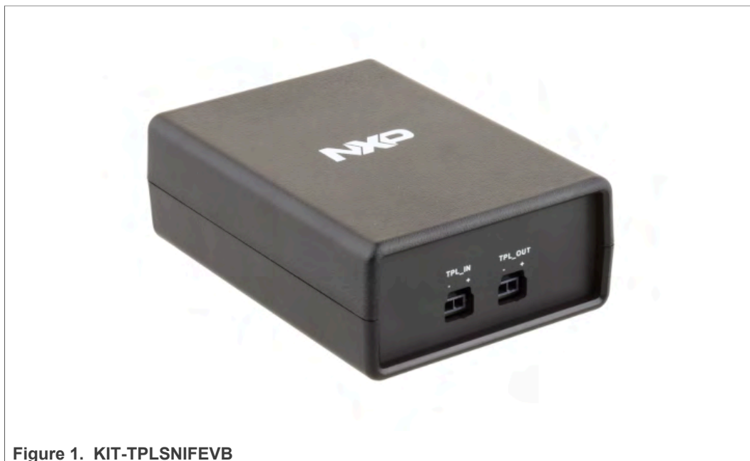
Figure 1. KIT-TPLSNIFEVB

The KIT-TPLSNIFEVB board, also called TPL sniffer is working with a logic analyzer (preferably a Saleae Logic Analyzer) and its software to help analyze any TPL signals.