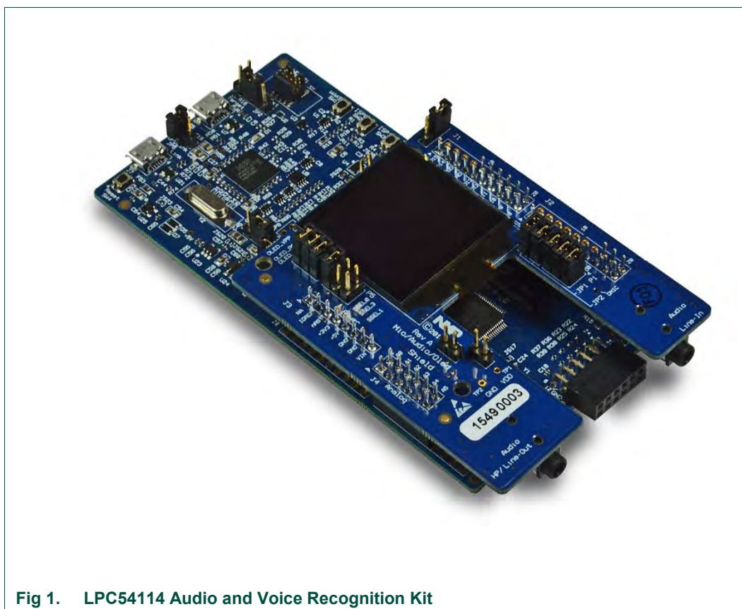
Fig 1. LPC54114 Audio and Voice Recognition Kit

The LPC54114 audio and voice recognition kit ("The Kit") combines the LPC54114 MCU with an OLED display, digital microphone and audio CODEC in a two board set, complemented by a software framework optimized for always-on sensing applications. The hardware consists of an LPCXpresso54114 board and Shield Board (Mic/Audio/OLED or MAO Shield), developed by NXP for flexibility and ease of use. The Kit can be used with a wide range of development tools, including the LPCXpresso IDE, Keil uVision, and IAR EWARM of NXP.