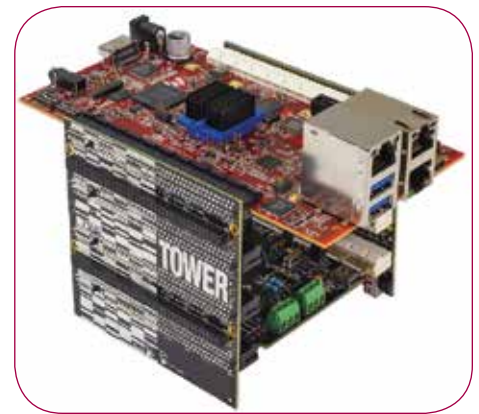
Figure 1. TWR-LS1021A module (TWR-LS1021A, TWR-SER-IO and TWR-ELEV)