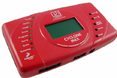
Figure 8-2: P&E's Cyclone MAX