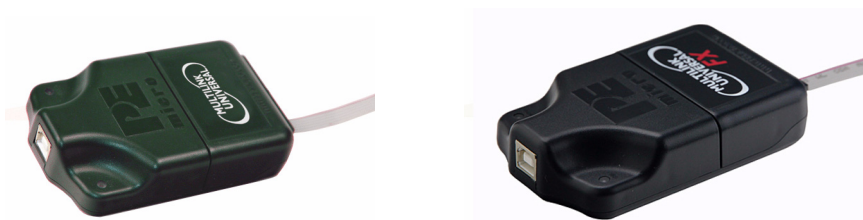
Figure 8-1: Multilink Universal (left) & Multilink Universal FX (right)