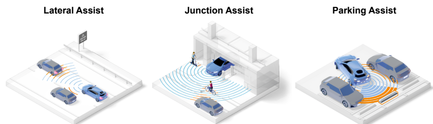
Figure 1: Target radar application