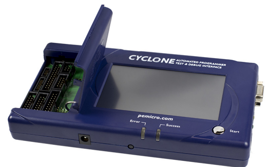
Cyclone LC programmer

The DSC Multilink is intended for development and is not designed to accommodate the demands of production programming. However, PEmicro's Cyclone LC and Cyclone FX programmers are specifically engineered to withstand the rigors of a production environment and will provide a seamless transition from the Multilink. In addition, the Cyclone FX offers an expanded feature set which includes faster communications, larger storage, expandable storage, enhanced security including SAP image encryption and programming restrictions, and expansion ports. More information is available online at: pemicro.com/cyclone .