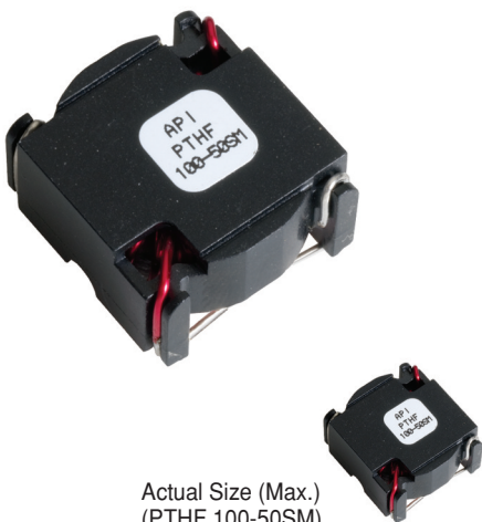
Actual Size (Max.) (PTHF 100-50SM)