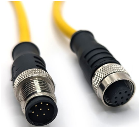
MALE FACE VIEW

(M12 Cordset, 8 Position, 24 AWG Shielded, Male Straight to Female Straight)