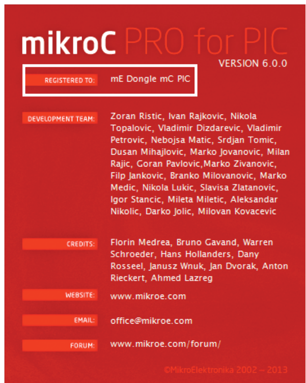
Figure 1-2: mikroC PRO for PIC® About Window