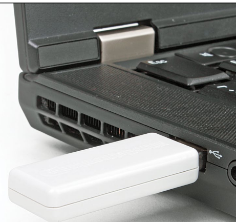
Figure 1-3: USB Dongle plugged into Laptop USB host connector

Unfortunately not. If you lose your dongle you will need to buy a new compiler license and pay the full price.