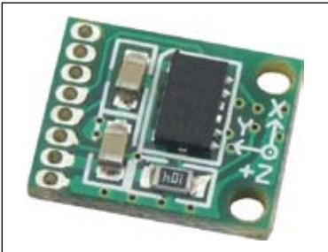
Figure 1: Accel SPI Board

Accel SPI Board is used to measure acceleration and gravity. The measurement on the additional board is performed by using the ADXL345 accelerometer circuit. The additional board is connected to the microcontroller on the development board via pads and communicates with the microcontroller by using serial SPI interface.