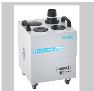
Solder fume extractors