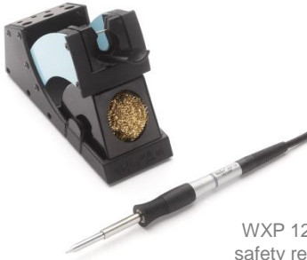
WXP 120 set with safety rest WDH 10