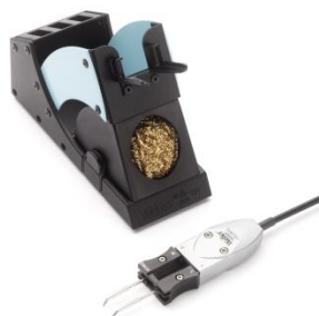
WXMT set with safety rest WDH 60

Order No. 0052920499 (0052920399 for pencil socket only)