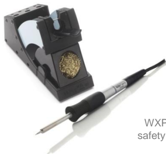
WXP 65 set with safety rest WDH 10