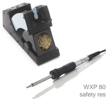
WXP 80 set with safety rest WDH 10

Order No. 0052921299 (0052921199 for pencil only)