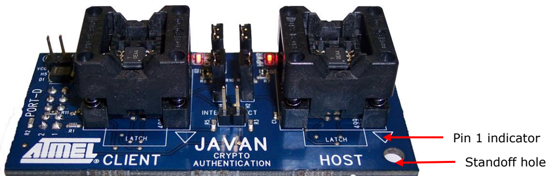
Figure 1-1. Atmel AT88CK109BK8 daughterboard

Atmel® AT88CK109BK8 is a daughterboard that interfaces with a mcu board via a 10-pin header. The daughterboard has two 8-pin SOIC sockets which can support HOST and CLIENT development with an Atmel ATSHA204 device. This kit uses a modular approach, enabling the daughterboard to connect directly to an STK series AVR development platform to easily add security to applications. An optional adapter kit is also available when the 10-pin header on the daughterboard requires a different pinout. The AT88CK109BK8 is sold with the Atmel AT88Microbase to form the Atmel AT88CK109STK8 starter kit. The AT88Microbase AVR base board comes with a USB interface that lets designers learn and experiment on their PCs.