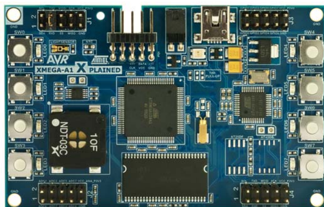
Figure 1-1. XMEGA-A1 Xplained evaluation kit.

The kit offers a larger range of features that enables the Atmel AVR XMEGA user to get started using XMEGA peripherals right away and understand how to integrate the XMEGA device in their own design.