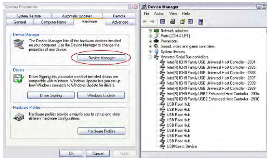
Figure 3 • USBxpress as Seen From the Device Manager Window