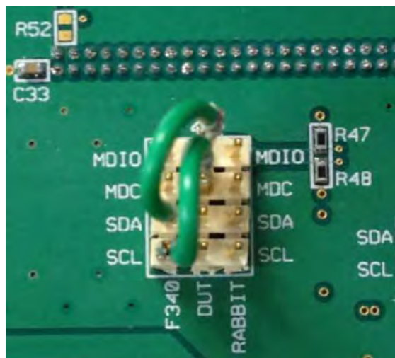
Figure 2 • MDIO/MDC Jumpers on J23 to SiLabs F340 pins

Note: A silk-screen error exists on the PCB for J23 such that the MDIO and MDC signals are swapped with the SDA and SCL signals respectively for the F340 and Rabbit signals. See the figure below for clarity of the default configuration.