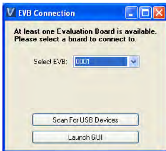
Figure 4 • Connection Window

The EVB serial number should appear. If not, click on “Scan For USB Devices.” Select that EVB serial number then click “Launch GUI”. The Register List window will appear as shown in the figure below.