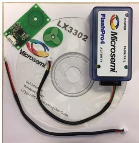
Figure one - LX3302A Evaluation Kit