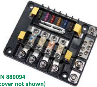
PN 880094 (cover not shown)