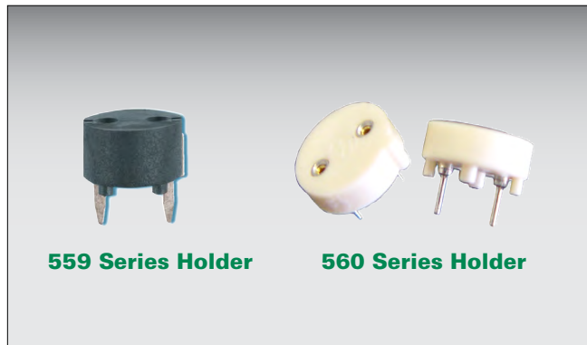
559 Series Holder