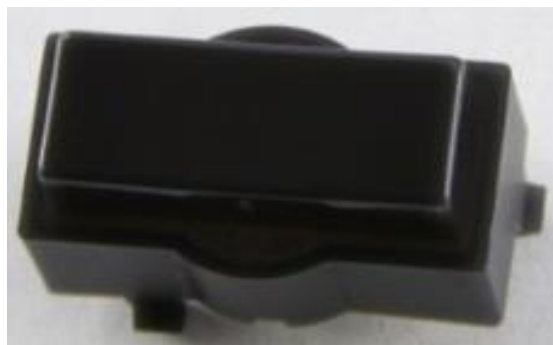
Figure 1 - ZNCL11 PIR Lens