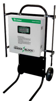
AC6000-CART-00 Two-wheeled Cart Optional for mounting ISB to allow for moving the unit while power is off