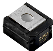
ZCASE® M6 Bolt-Down Fuses