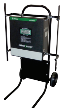
AC6000-CART-00 Two-wheeled Cart Optional for mounting ISB to allow for moving the unit while power is off