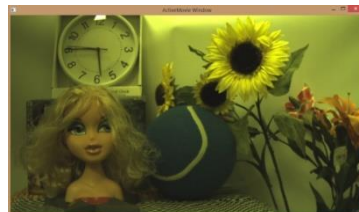
Camera Tool view mode