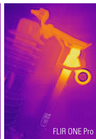
FLIR ONE Pro