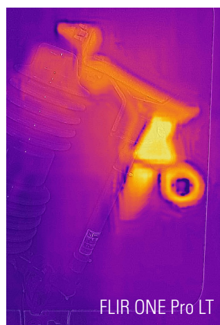
FLIR ONE Pro LT