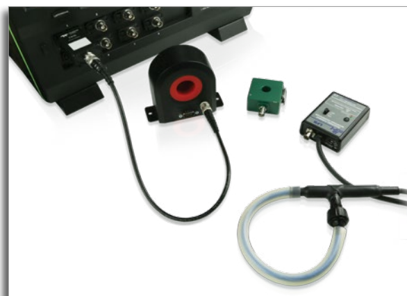
CA10 ProBus current adapter attached to a Danisense Current Transducer. Also shown is a Pearson Current Transformer and a PEM-UK Rogowski Coil, which are also third party devices that can be used with the CA10.

Local sales offices are located throughout the world. Visit our website to find the most convenient location.