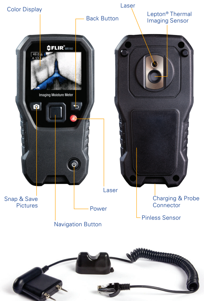
MR02 Pin Probe included

PORTLAND Corporate Headquarters FLIR Systems, Inc. 27700 SW Parkway Ave. Wilsonville, OR 97070 USA PH: +1 866.477.3687