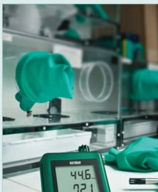
Monitor and record temperature and humidity values in the calibration rooms, office, clean rooms, and storage facilities